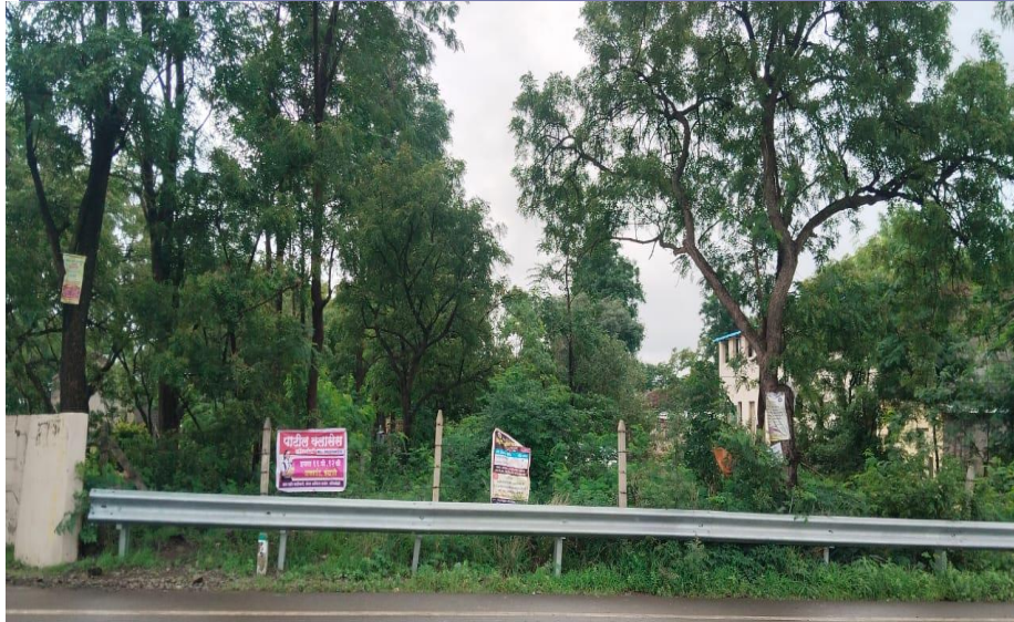
Main Building :